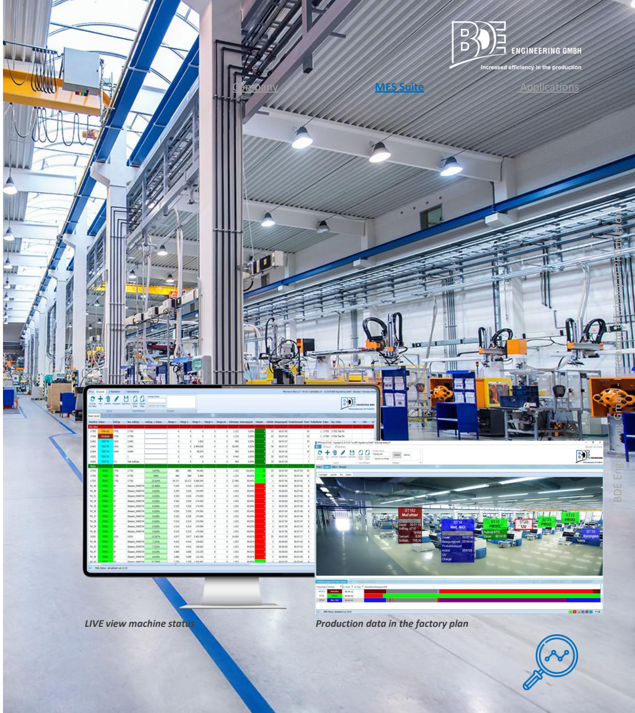
LIVE view machine status

Through our MES solution, you can view all machines in each plant at a glance in real time and intervene directly if necessary.